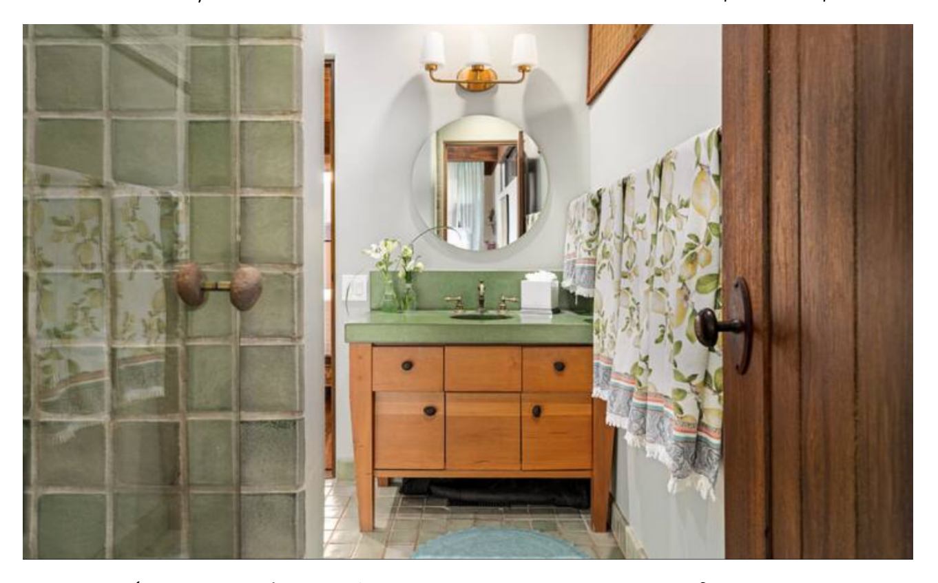
King (Shanti Room) shared bathroom with the Library Loft occupants.