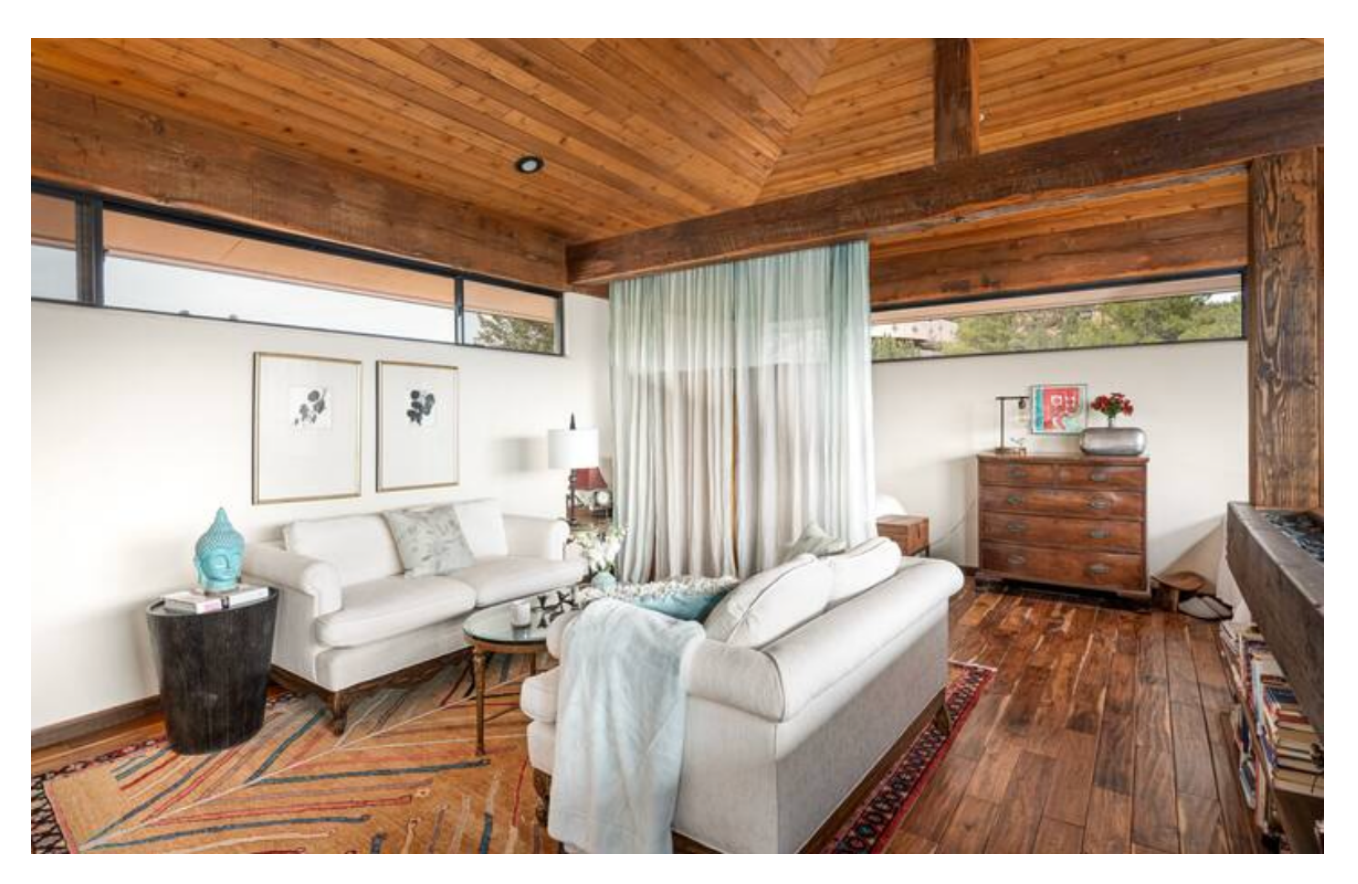
The Library loft houses over 110 titles of books. One full bed is located behind the curtain and the other is directly across from it to the right in this photo.