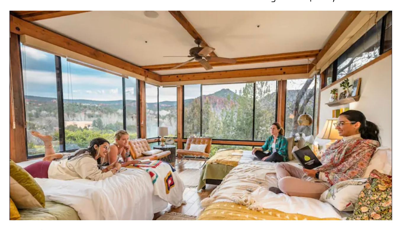
The Africa Room: 1 King bed, 1 Full bed, 1 Queen bed. Shared shower room includes 2 private showers, 2 private toilets, and a double sink. Panoramic Red Rock Mountain Views.