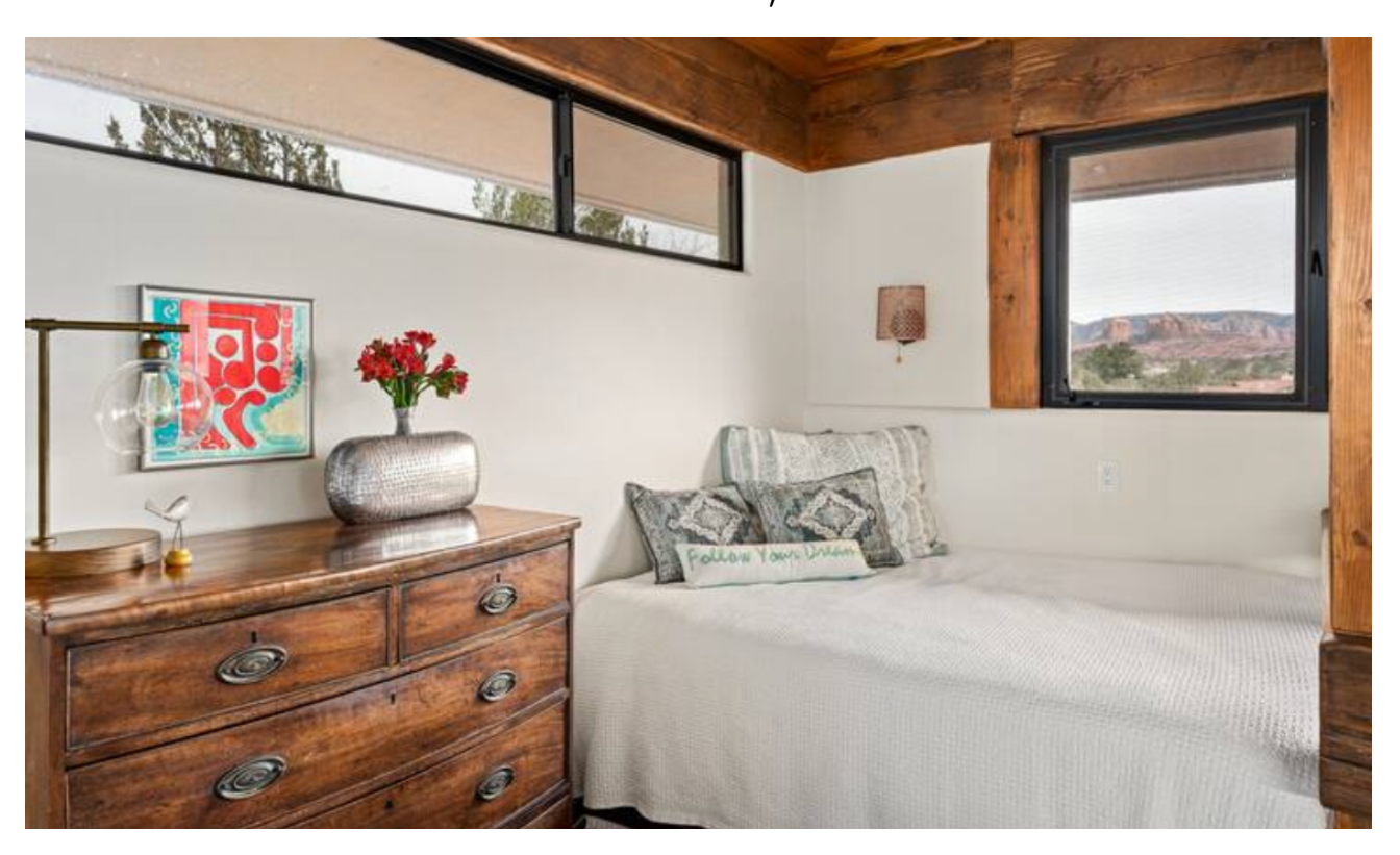
The Loft is off the library upstairs. This is is the second full sized bed which is located directly across from the bed behind the curtain in the previous photo.

Full sized bed located behind the privacy curtain in the upstairs library loft. The other full sized bed is directly across from this.